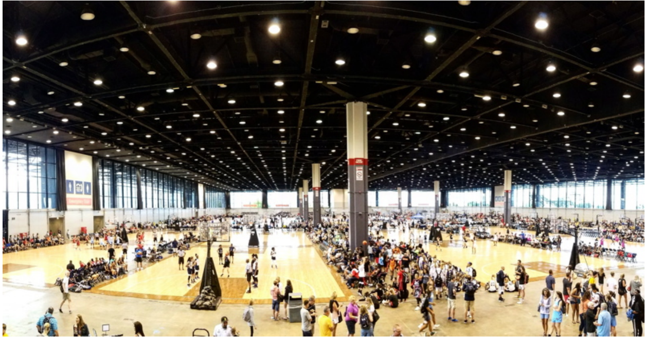
Hall D. We plan to use the left half of this space.

See a full virtual tour of the venue here .